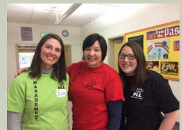
MCEDD staff at the robotics tournament in The Dalles