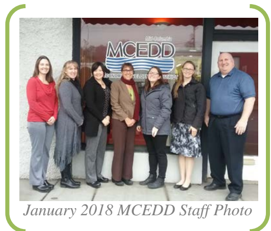
January 2018 MCEDD Staff Photo