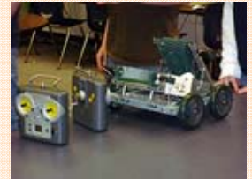
HRVHS students model their robotics project.

MCEDD assisted the GTA in creating a partnership with SAO (Software Association of Oregon) to increase opportunities for engaging speakers and connecting with statewide initiatives. Through SAO, the GTA also began exploring healthcare resources for small technology employers.