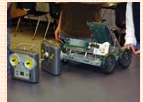
HRVHS students model their robotics project.

MCEDD assisted the GTA in creating a partnership with SAO (Software Association of Oregon) to increase opportunities for engaging speakers and connecting with statewide initiatives. Through SAO, the GTA also began exploring healthcare resources for small technology employers.