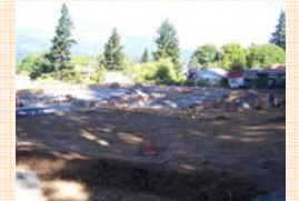
Cascade Locks Fire Station, Under Construction

Washington Community Trade and Economic Development Department awarded Klickitat County a $389,000 Community Development Block Grant in 2006. This funding will construct a new fire hall and community center in High Prairie, Washington. MCEDD works closely with representatives from the Klickitat County Fire District #14 and High Prairie Community Council to implement this project. To date, this project has completed an environmental review, gone to bid and is in the process of developing a second bid package with construction planned for 2008.